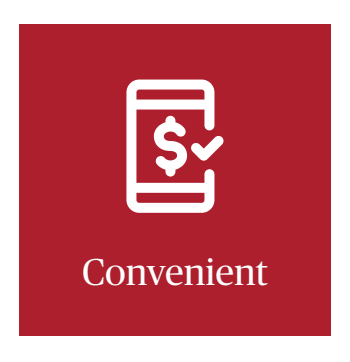
Access billing and payment information at your convenience.